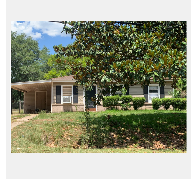
Tue, 28 Jun 2022 12:27:37 EDT 318 Vick St, Albany, GA 31705, USA