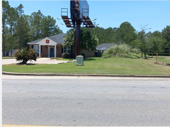
Wed, 22 Jun 2022 13:18:23 EDT 535 N Westover Blvd, Albany, GA 31707, USA