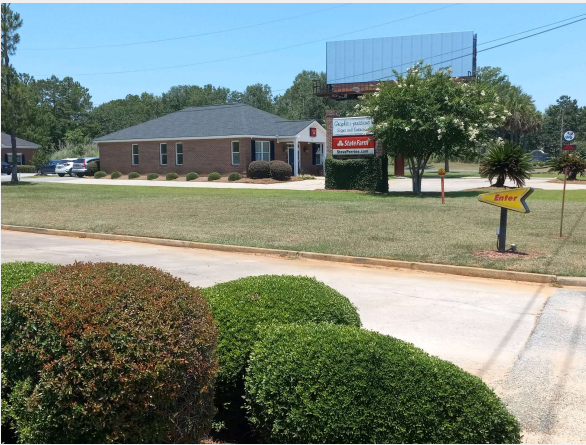
Wed, 22 Jun 2022 13:18:28 EDT 519 N Westover Blvd, Albany, GA 31707, USA