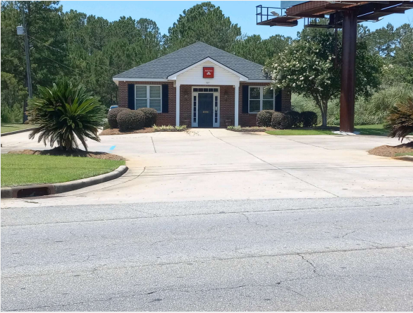
Wed, 22 Jun 2022 13:18:18 EDT 535 N Westover Blvd, Albany, GA 31707, USA

Project Name: Exterior Property Survey 040-2/00000/15B Albany GA 161 537 N Westover Blvd, Albany, GA 31707, USA